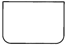
Figure 2B.—OPTIONAL BODY BLOCK FOR CENTER SEATING POSITIONS