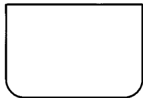
Figure 2A.—BODY BLOCK FOR LAP BELT ANCHORAGE